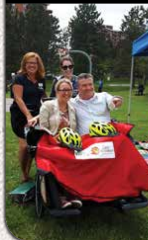
Cycling without Ages

Help EORC Raise funds by Shopping Online: https://www.eorc-creo.ca/WebGiv.php