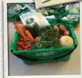
Good Food Box