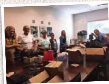
Volunteers hard at work preparing for Cruise don't Bruise