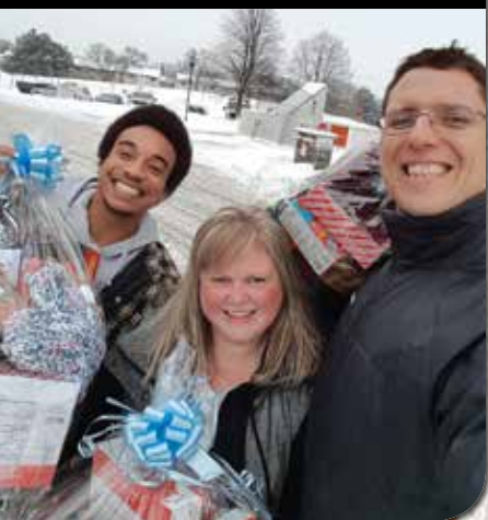
Youth delivering Christmas baskets