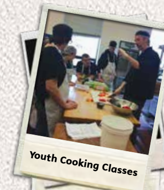
Youth Cooking Classes