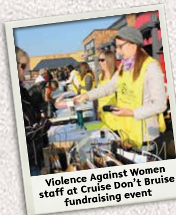
Violence Against Women staff at Cruise Don't Bruise fundraising event