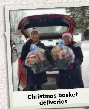
Christmas basket deliveries