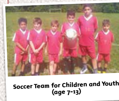
Soccer Team for Children and Youth (age 7-13)