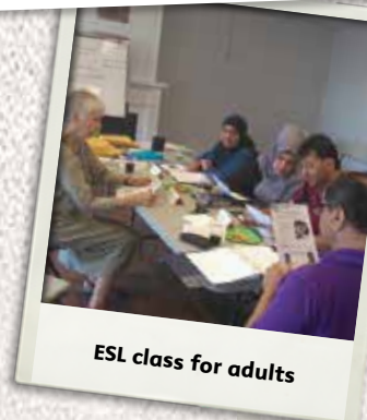
ESL class for adults