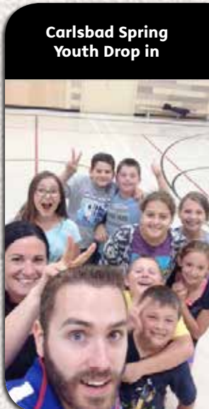
Carlsbad Spring Youth Drop in