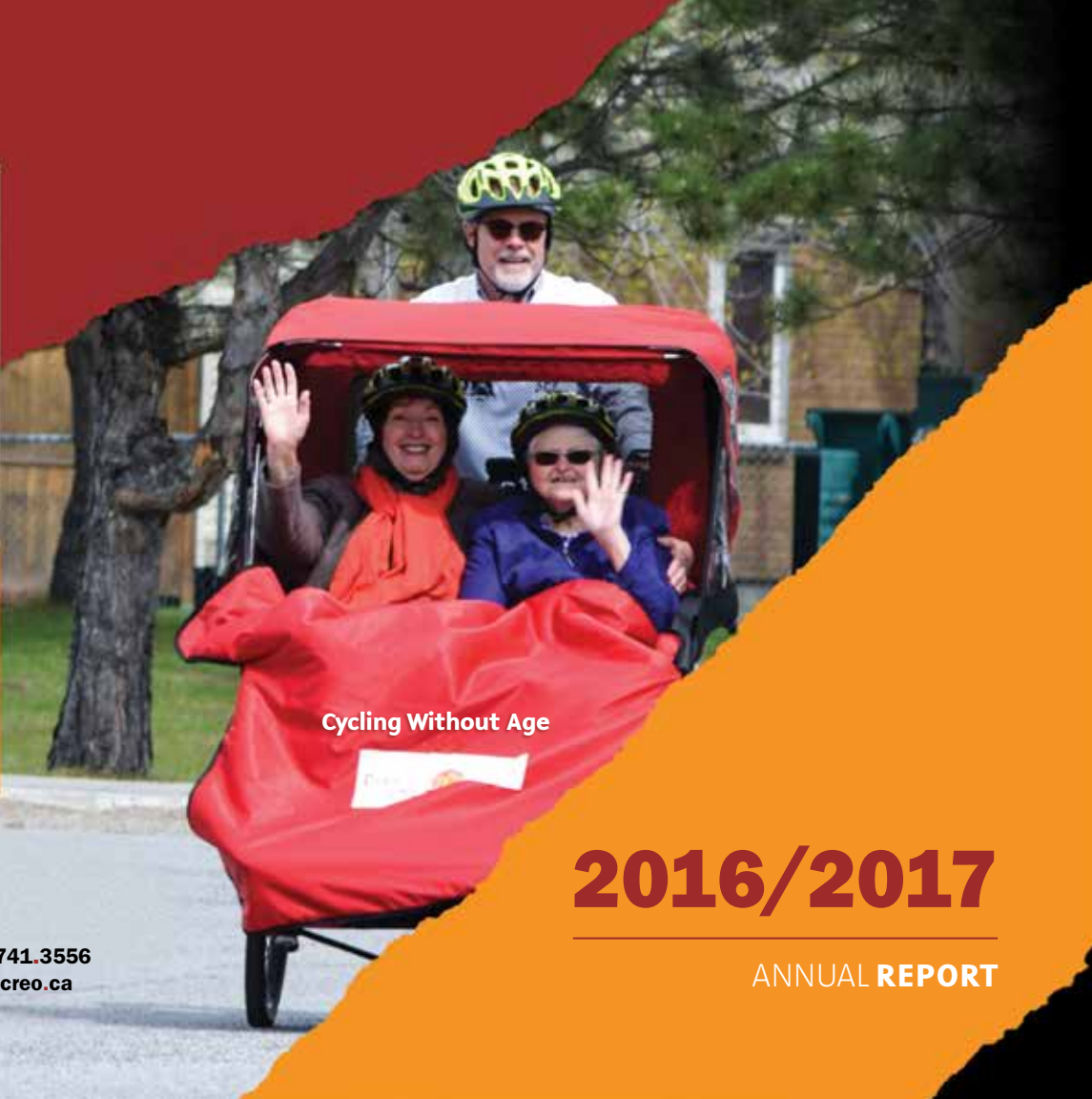
Cycling Without Age

Tel: 613.741.6025 • TTY: 613.741.3556 www.eorc-creo.ca • Info@eorc-creo.ca 1980 Ogilvie Road, Suite 215 B.N. 12960 2470 RR 0001